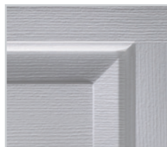
Cape Cod Gray