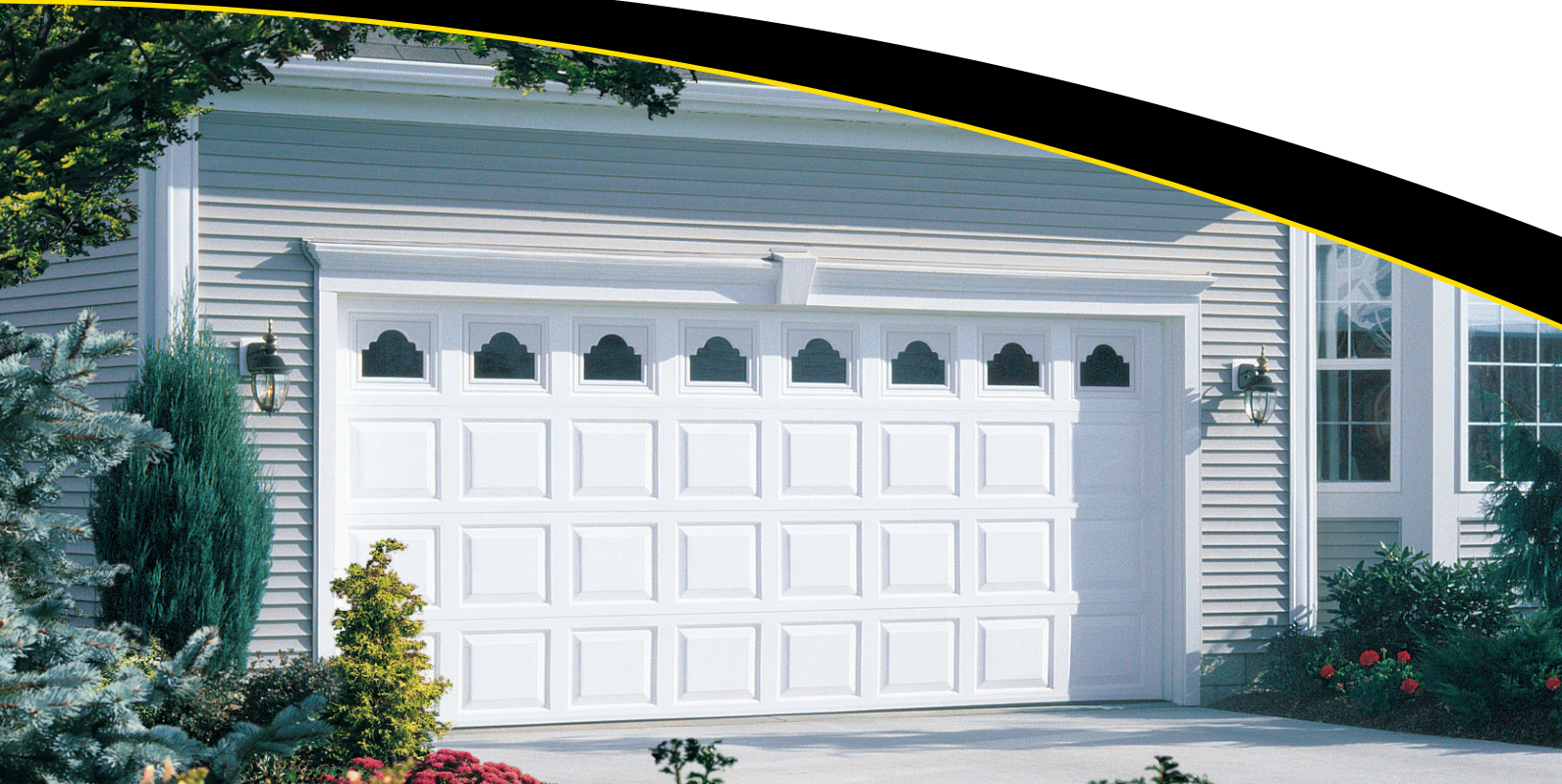
Colonial Panel, White finish, Ruston windows

VINYL GARAGE DOOR R-10* Polyurethane Insulation UV Resistant