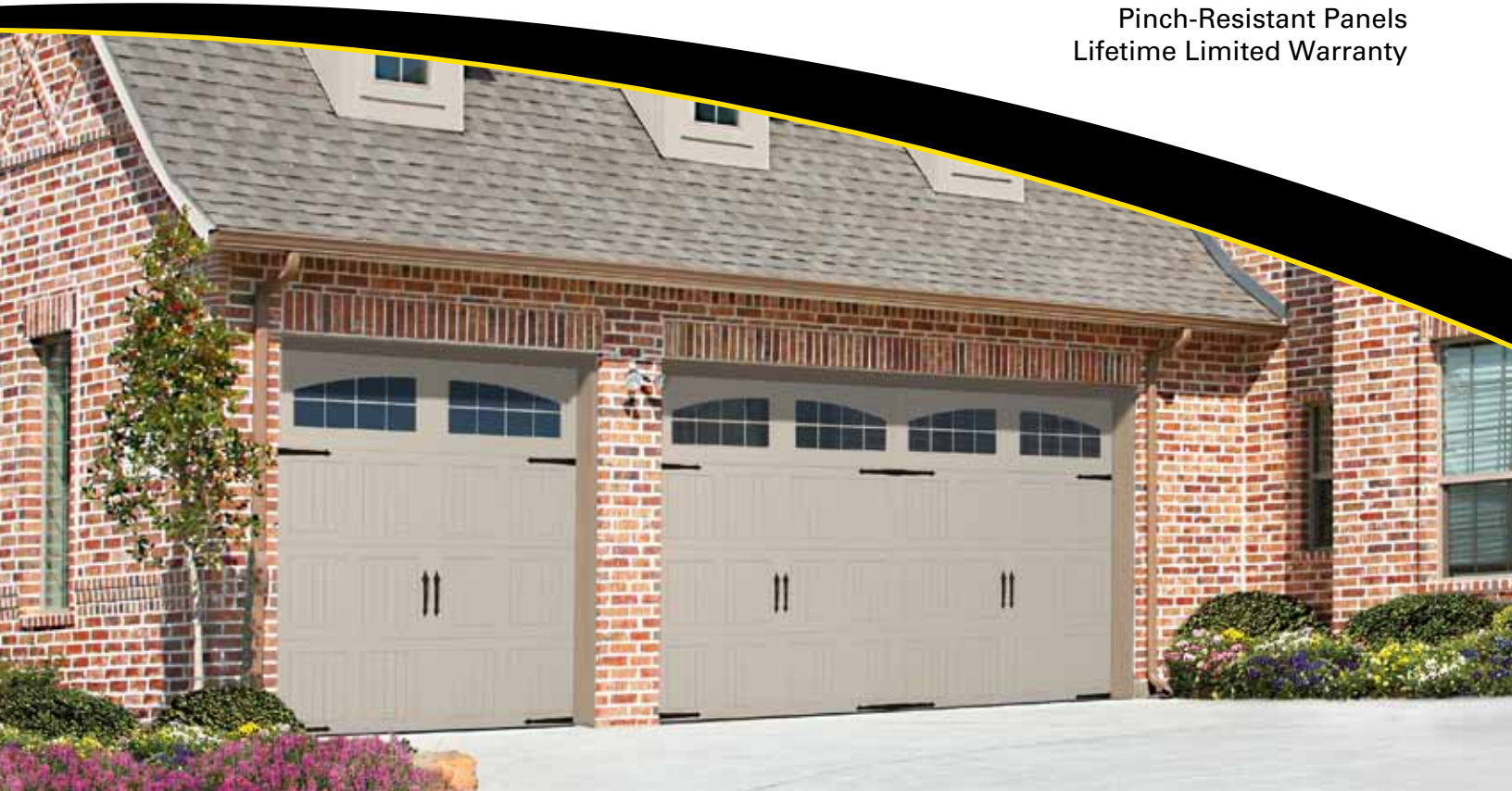
Sonoma Panel, Desert Tan Finish, Arched Stockton Windows

R-11* Polyurethane Insulation Pinch-Resistant Panels Lifetime Limited Warranty